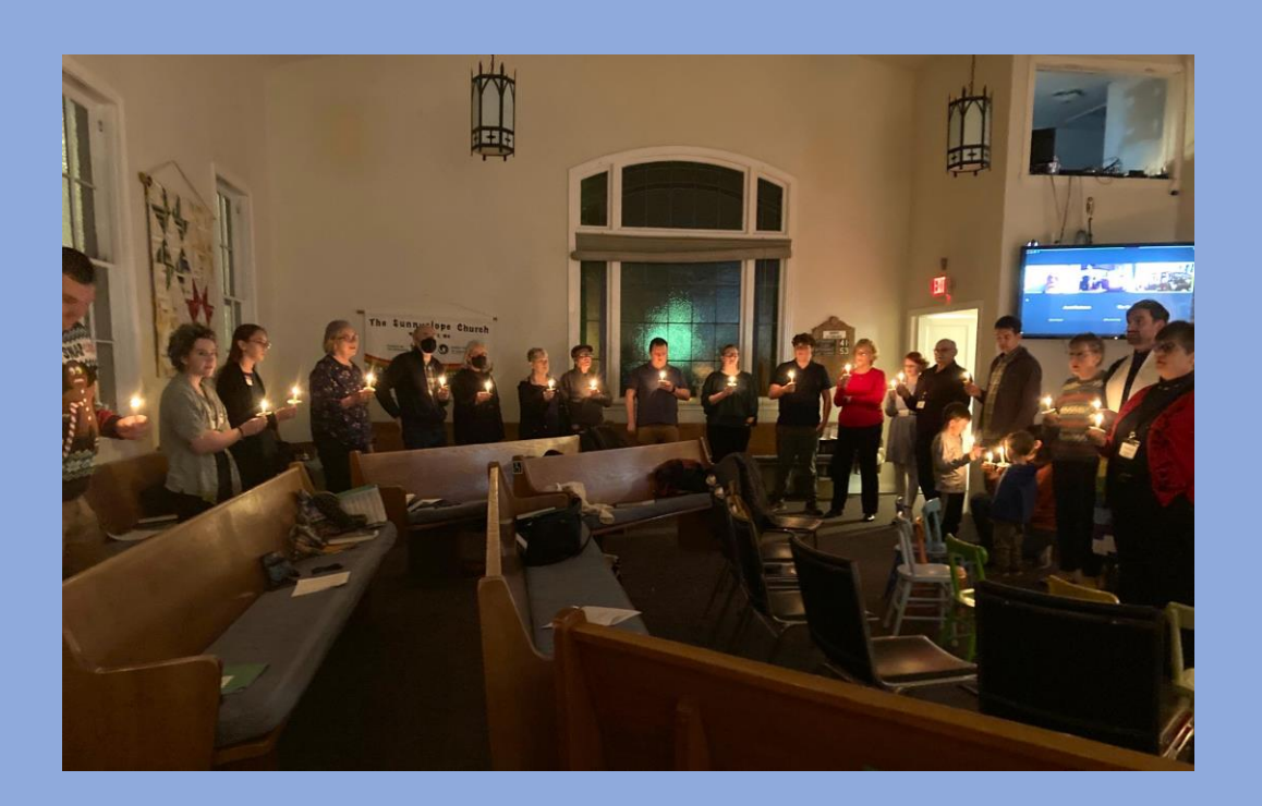
Christmas Eve Candle Lighting Service