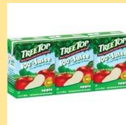
Fruit Juice boxes