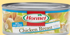
Canned Chicken or Tuna