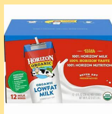
Shelf Stable Milk boxes