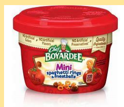
Single serve pasta cups